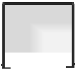
Countertop Single Screen, Clear Acrylic

The Retail and Medical Guardiant™ Countertop Shield is a plexiglass sneeze guard built to help reduce the spread of contagious, airborne germs commonly spread by coughing or sneezing. Create a protective shield in any place of commerce that requires direct interaction between employees and customers in close proximity such as POS checkouts.