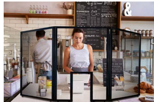
Countertop Screen, Clear Acrylic $699

Contact info@prismrbs.com for more information