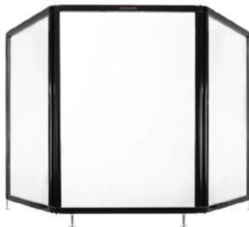
Countertop Screen, Clear Acrylic