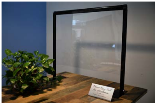
Countertop Single Screen, Clear Acrylic $199

The Retail and Medical Guardiant™ Countertop Shield is a plexiglass sneeze guard built to help reduce the spread of contagious, airborne germs commonly spread by coughing or sneezing. Create a protective shield in any place of commerce that requires direct interaction between employees and customers in close proximity such as POS checkouts.