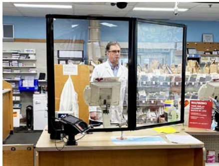
Countertop Screen, Clear Acrylic $599