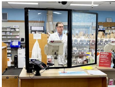
Countertop Screen, Clear Acrylic $599