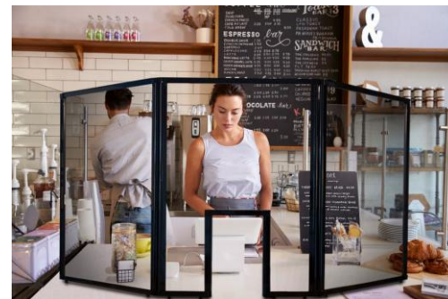
Countertop Screen, Clear Acrylic $699

Contact info@prismrbs.com for more information