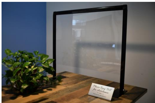
Countertop Single Screen, Clear Acrylic $199

The Retail and Medical Guardiant™ Countertop Shield is a plexiglass sneeze guard built to help reduce the spread of contagious, airborne germs commonly spread by coughing or sneezing. Create a protective shield in any place of commerce that requires direct interaction between employees and customers in close proximity such as POS checkouts.